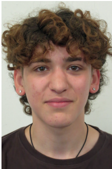
DEPUTY HEAD PREFECT: AB